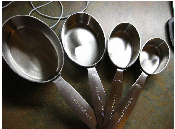
Figure 1. The website ChooseMyPlate.gov can help you to plan nutritional meals.